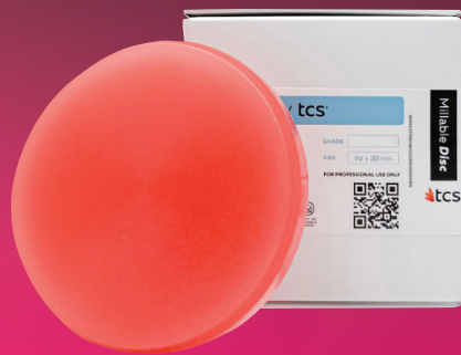
Standard Pink 98mmø