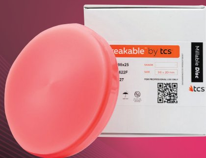
Standard Pink 98mmø

Use in conjunction with either milled teeth in PMMA or zirconia as your perfect functional partner.