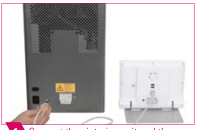
Connect the sintering unit and the control unit with the connecting cable.