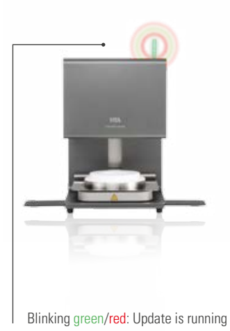
Red: Error - blinking mode