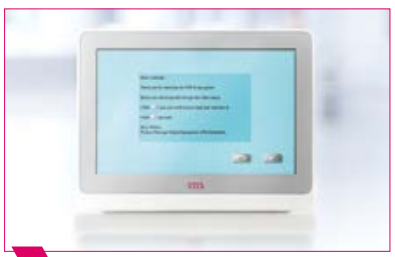
Now follow the guided initial setup.