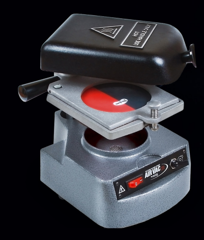
AIR VAC XQ #7000470

The Pressure Dome teams up with vacuum formers to create a better fitting dental appliance.