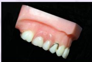
Wrought Wire Clasp