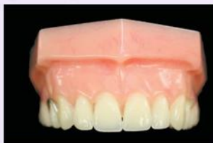
Wrought Wire vs Itsoclear