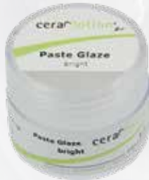
ceraMotion® Zr Paste Glaze bright