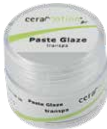
ceraMotion® Zr Paste Glaze transpa