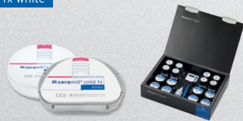
Ceramill Liquid FX