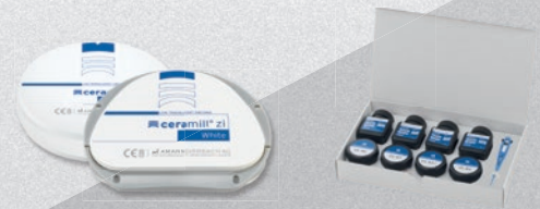
Ceramil Liquid CL