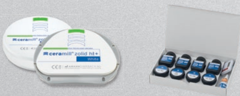
Ceramill Liquid new formula