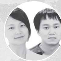
Lv BaoPing DT Master Dental, China

"All the shades of Zolid FX PS and ML match the VITA Classical color guide perfectly. Due to its high level of esthetics I can also use it for monolithic restorations."